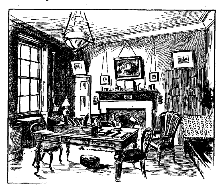
The Study in St. Anne's Rectory, in which the first Committee Meetings were held, showing the tablet on the chimney-piece (see page 73).

There he studied the needs of the great dark world, the possibilities of its evangelization, the problems of so vast an enterprise; and there, as we shall see, he in after years compiled month by month the current history of all its branches. There he thought out, and prayed over, his plans for his own infant Society. There he interviewed likely, and (more often) unlikely, candidates for missionary service. There he wrote his long letters to Africa and India and New Zealand, in days when shorthand-writers and copying-presses were unknown, and when there were no mailsteamers to carry his correspondence or bring back the answers. There he bore the burden of what became a rapidly growing organization; and there, in simple faith, he daily and hourly cast his burden upon the Lord.