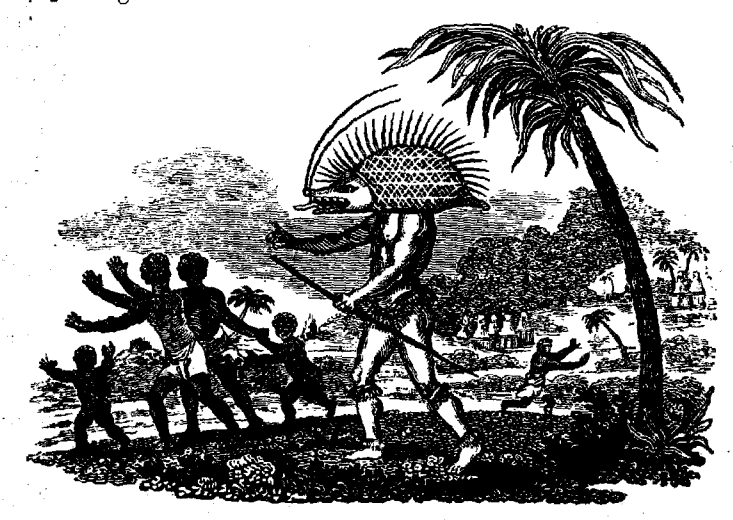
The First Picture in a Missionary Magazine, the Missionary Register of April, 1816; representing a scene in West Africa.

This Missionary Register was unquestionably a great power in its early years. Though not an official publication of the Church Missionary Society, it was naturally identified very closely with it by Pratt being the editor; and the Society purchased some thousands of copies every month for free distribution among subscribers and collectors. It was ultimately superseded by the various periodicals started at different times by the Societies themselves in their individual interest; but the forty-three volumes will always remain a monument of sanctified industry and a storehouse of valuable information concerning the progress of the Kingdom of God.